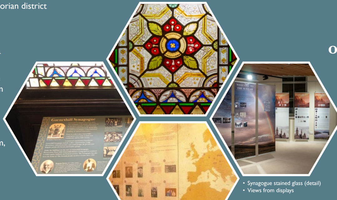
• Synagogue stained glass (detail) • Views from displays

View and follow the Jewish Glasgow: Garnethill Refugee Trail to discover places in Garnethill that are connected with Jewish refugees who came to Glasgow from Europe before, during and after the Second World War: www.sjhc.org.uk/jewish-glasgow-garnethill-refugee-trail/